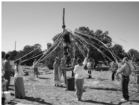
Maypole dancers at the EMAAC May Festival

Please give these donors your thanks and support!