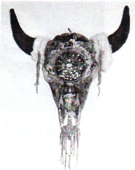
"White Buffalo Woman" by Candace Lee