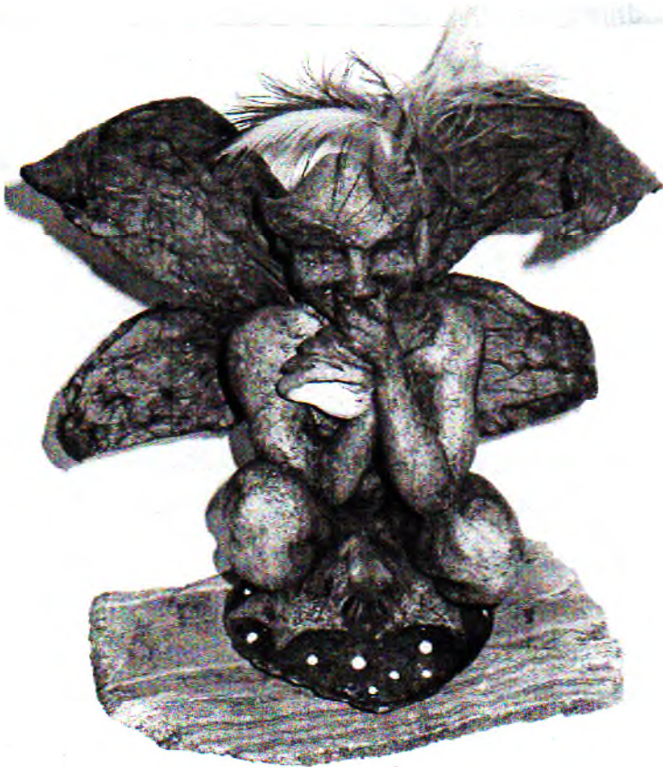
"The Caller" by Gentle