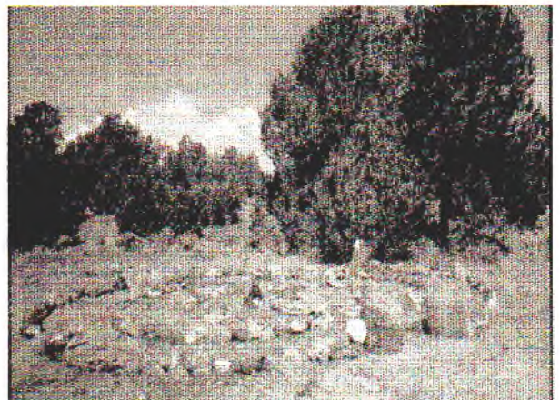
The Labyrinth at the Old School Gallery