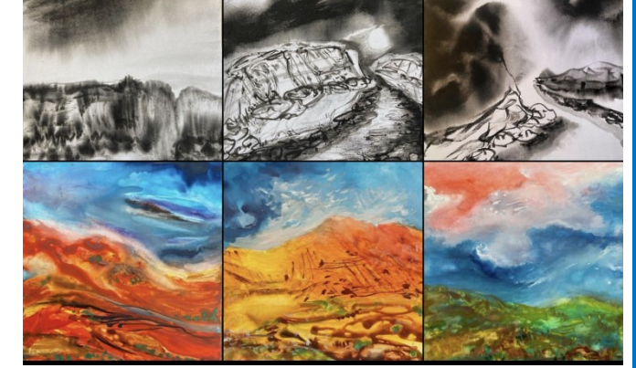
Paintings-Ink and Watercolor