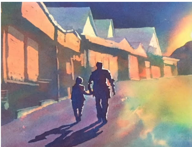
Watercolor by Craig Dixon

Craig Dixon and Lorena Willmon look forward to sharing their art for the second quarter of 2023. Their show features pieces that aim to bring a splash of color and a smile. On display will be a sample of their watercolors and metal art, as well as Lorena's clay creations.