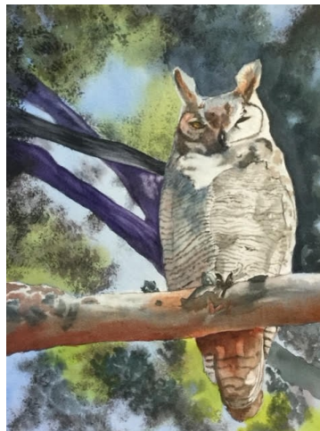
Watercolor and clay sculpture by Lorena Willmon